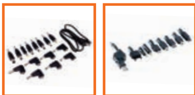
'Tip pack 1'