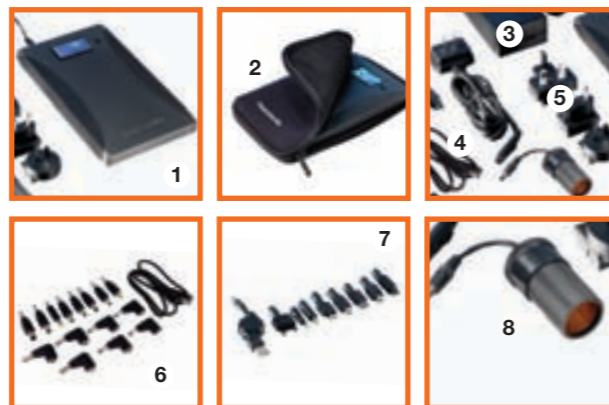
'Tip pack 1'