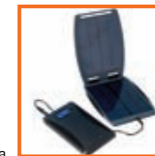
solargorilla charging powergorilla