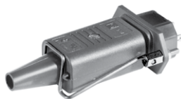
Cord retaining kits Cord retaining strain relief