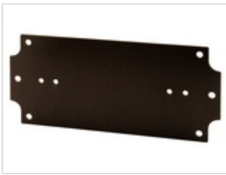
Mounting plates, laminated paper (Pertinax), galvanised steel for version 260