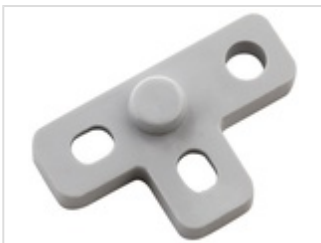
Wall brackets on rear, screw-on, polycarbonate