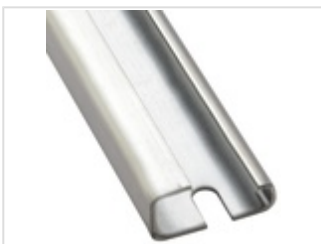
DIN rails DIN EN 60715 G 32

For M/T 219-220, M/T 231-235, M/T 238, M/T 246, P 325, M/T 2381