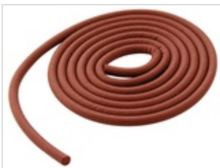
Silicone seal for lid