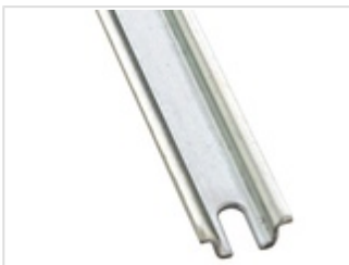
DIN rails DIN EN 60715 TH 15