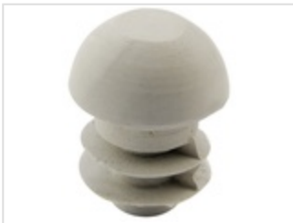
Rubber feet, plug-in